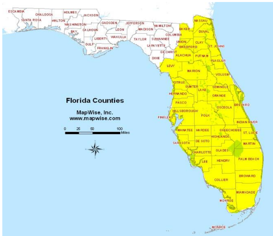
Figure 1b: Affected counties highlighted in yellow.